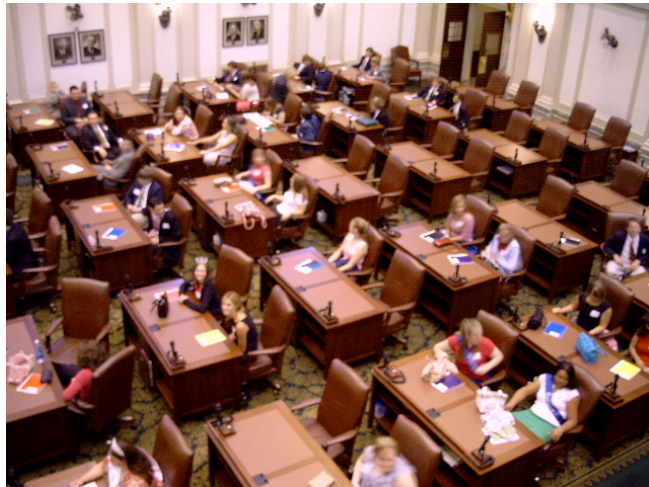
Our "legislators" hard at work at the state capitol.

Uh, where are you guys going with all those swords???