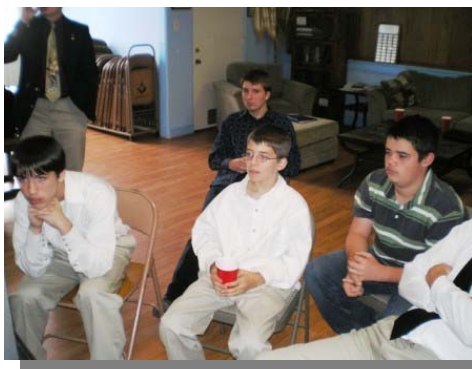
DeMolay initiates enjoying a little movie time at Frank S. Land day